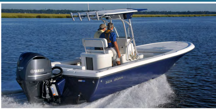
Note: Boat shown with optional outboard power.