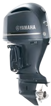
Test performed and verified by Yamaha Applications Engineers.